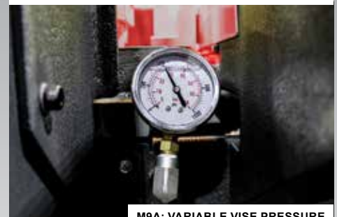
M9A: VARIABLE VISE PRESSURE