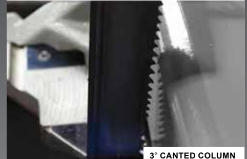
3° CANTED COLUMN