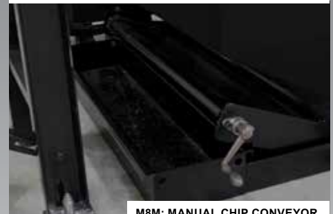
M8M: MANUAL CHIP CONVEYOR