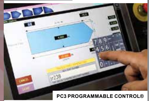
PC3 PROGRAMMABLE CONTROL®

MAXIMUM LOAD CAPACITY 500 POUNDS/FOOT, UP TO A MAXIMUM OF 7,000 LBS TOTAL WEIGHT.