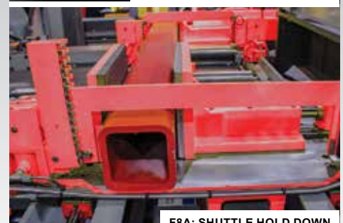
F8A: SHUTTLE HOLD DOWN