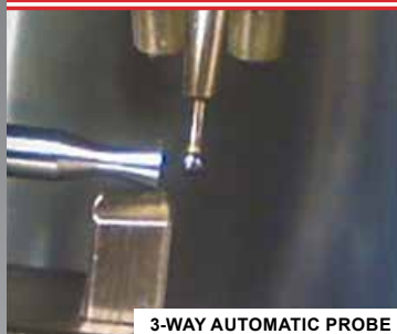
3-WAY AUTOMATIC PROBE