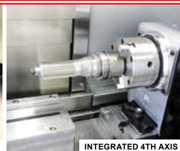
INTEGRATED 4TH AXIS