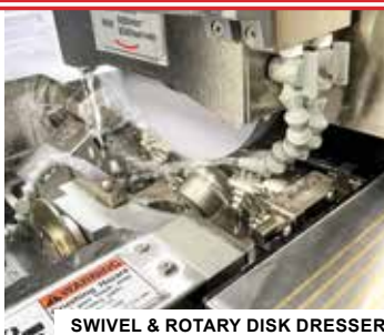
SWIVEL & ROTARY DISK DRESSER