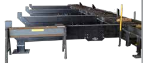
10' ROLLER TABLE