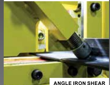
ANGLE IRON SHEAR