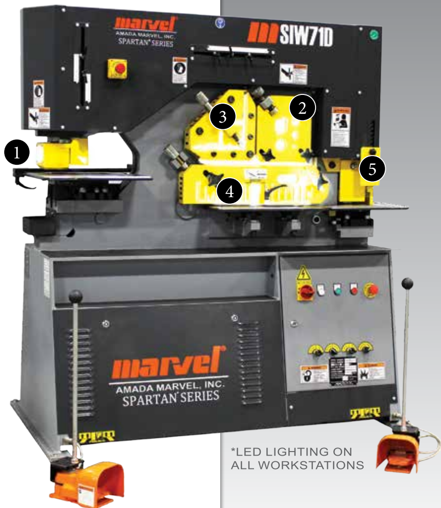
*LED LIGHTING ON ALL WORKSTATIONS