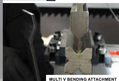
MULTI V BENDING ATTACHMENT