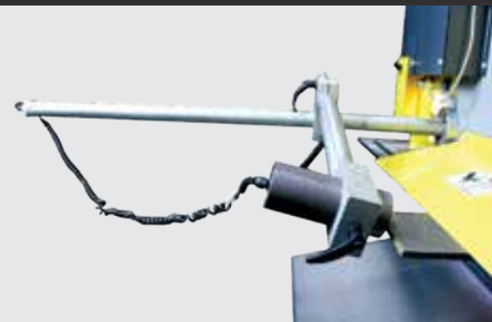
ELECTRIC BACK GAUGE

*Pictures may include some optional equipment.