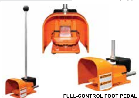
FULL-CONTROL FOOT PEDAL