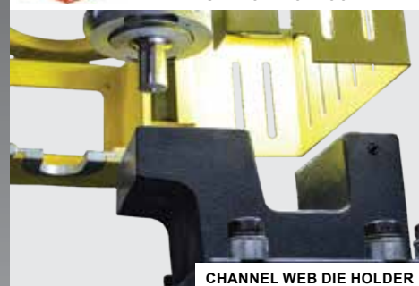
CHANNEL WEB DIE HOLDER