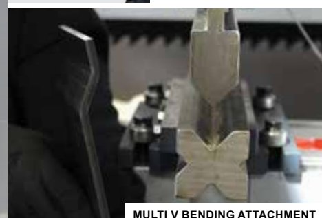
MULTI V BENDING ATTACHMENT