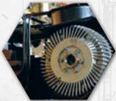
Electro-magnetic brake applies multiple step braking torque that minimizes resonance.