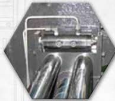
Floating feed system prevents raw material from crashing with front vise.